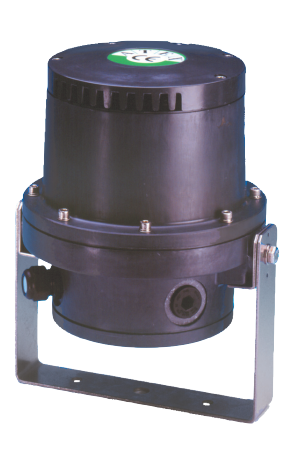
Applications - General signalling; evacuation and process control alarm